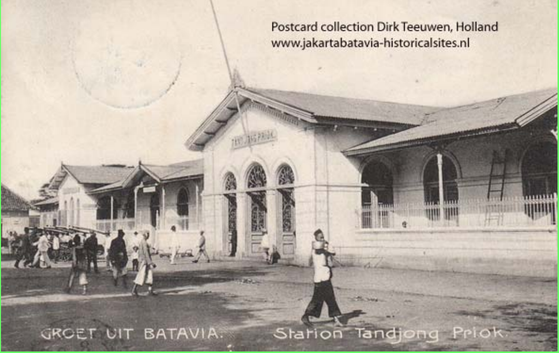
3. Tanjung Priok first (old) railway station, circa 1900